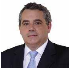
Sérgio Ávila, Vice-President of the Regional Government of the Azores

“Given the specificities of the region, an archipelago of nine islands with very different realities and requirements, the Regional Government is proud of having been able to implement, in just 8 months, a human resources management model, based on pioneer (and unique, to date) support tools, which is leading Azorean Regional Administration to a new organizational model.”